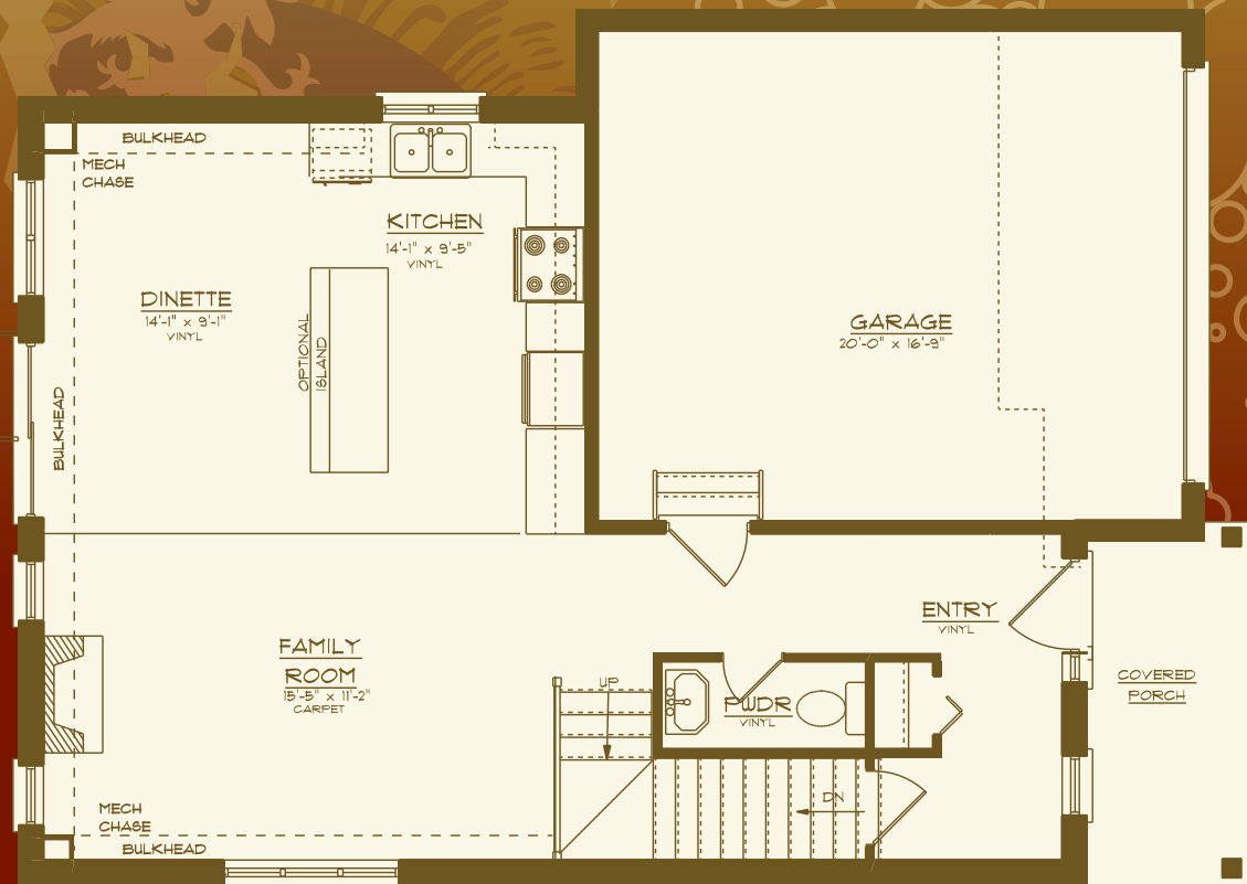
Main Floor 745 Sq. Ft.